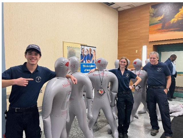
Mountainside Hospital Surge Drill