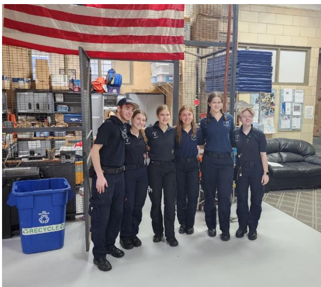
Seniors at the Rhino Romp

As the field of EMS changes, we are committed to making sure our members are trained in the most up to date BLS medical interventions and protocols. Thanks to the generosity of our community, we were able to send 8 members to the EMS Council of NJ educational symposium and recently we acquired a training manikin, which we can use to practice airway management, lifting and moving techniques and number of other very valuable skills. We also have worked with Mountainside Hospital in a Patient Surge Drill to train for a mass casualty event.