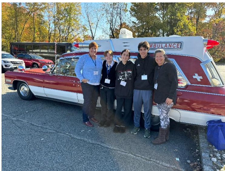
EMS Council Training